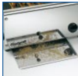
Large full depth crumb tray

With their timeless design and sleek elegant lines the Lincat LT4X and LT6X slot toasters will look good in any situation, whether front of house or behind the scenes. As well as good looks the LT4X and LT6X slot toasters offer excellent performance and durability with a unique lifting system, extra deep toasting slots for larger slices, powerful elements and strong fixed element guards for added protection.