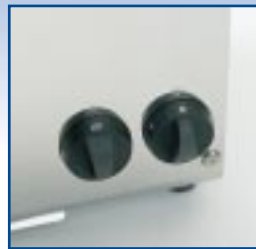
Slot selector and timer switches