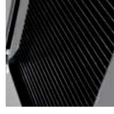
Close-pitch ribbed surface with non-stick coating