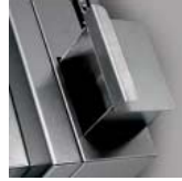
Large far collection drawer