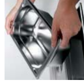
Supplied with stainless steel GN containers