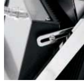
Remaining mechanism holds plate in perfect position