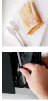
User-changeable quartz infra-red elements