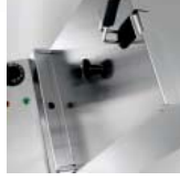
All Lynx 400 fryers are supplied with lids