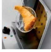
Large tank in LFF is ideal for free frying