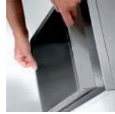
Removable tank allows wet heat models to be operated with dry heat