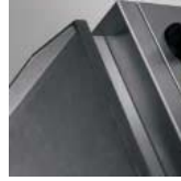
One-piece cast iron griddle plate