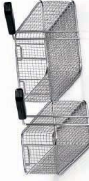
Supplied with chrome-plated wire mesh baskets