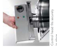
Control head fits securely in place