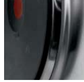
Sealed hotplates for easy cleaning