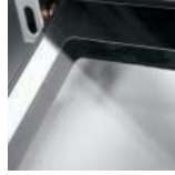
Energy-efficient double-glazed door