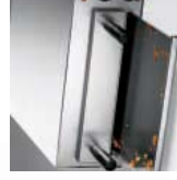
Large crumb tray for easy cleaning