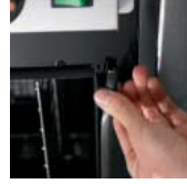
User-replaceable door seals