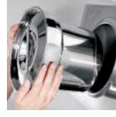
Supplied with stainless steel round pots